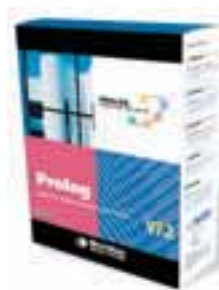
Prolog deploys quickly and easily, yet offers robust functionality and in-depth customization.

Created by project control software experts, Prolog speaks construction language and offers the functionality construction organizations need to automate, streamline and standardize essential processes. Prolog helps to increase timely communication